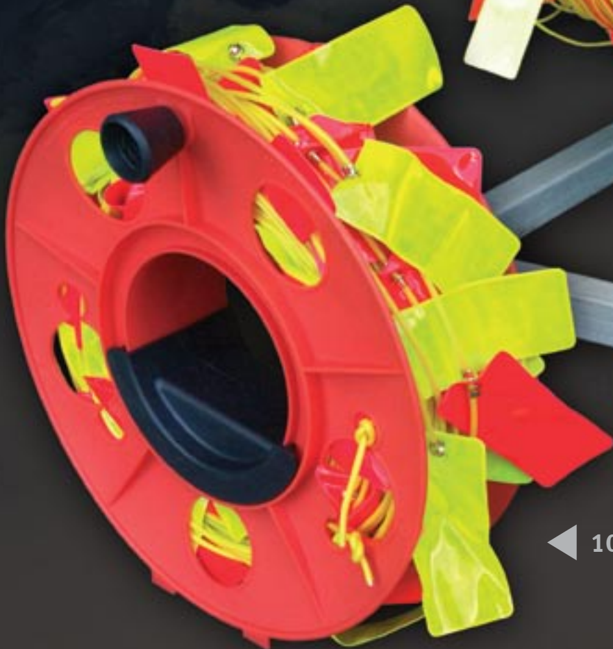
◀ 100m hand reel

ph: 1300 857 500 fax: 1300 857 250 web: hi-vis.com.au