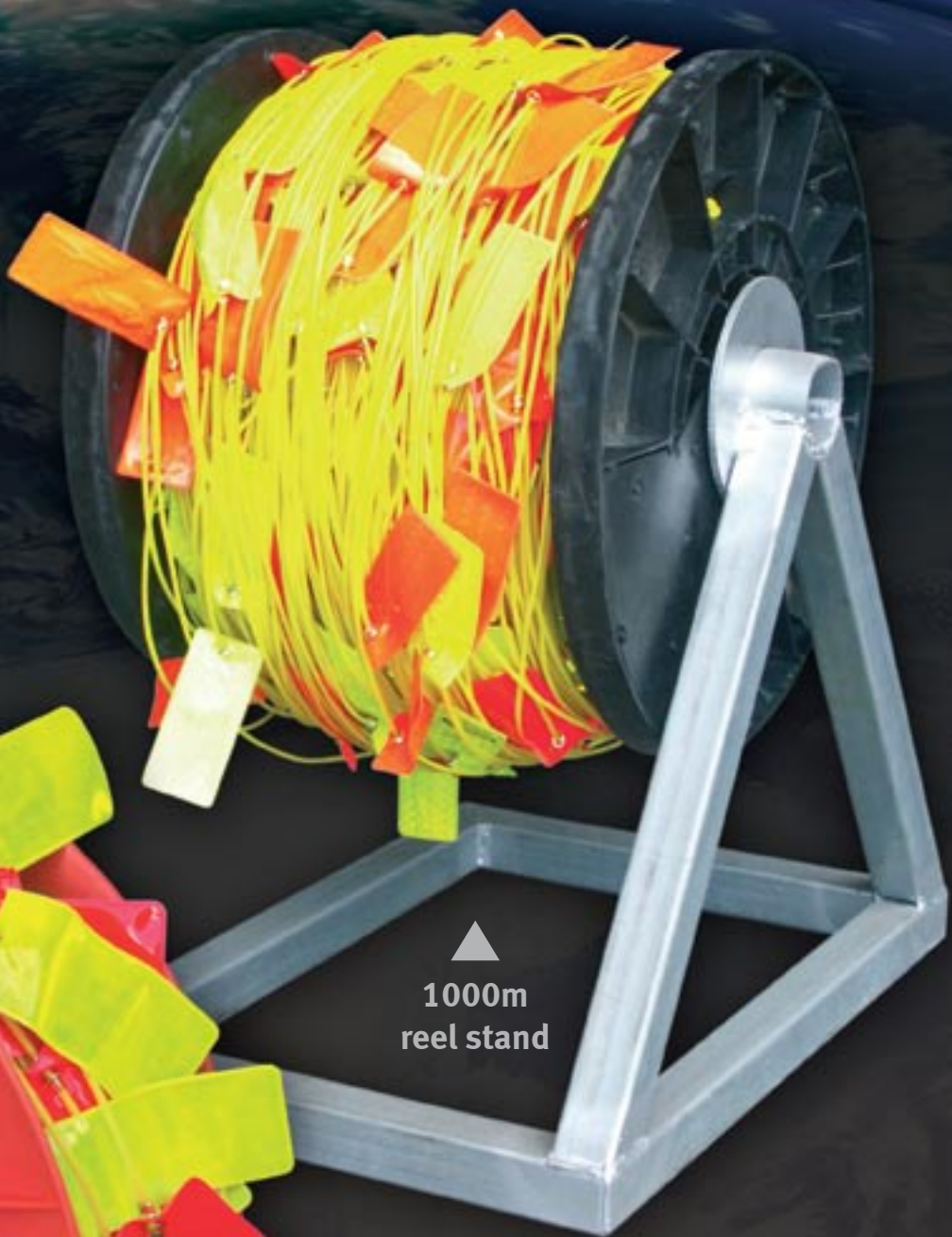
▲ 1000m reel stand

REFLECTALINE IS A FLEXIBLE REFLECTIVE BARRICADING SYSTEM DEVELOPED BY HI-VIS FOR USE ON MINE SITES AND OTHER AREAS WHERE A HIGHLY VISIBLE BARRIER IS REQUIRED DAY AND NIGHT